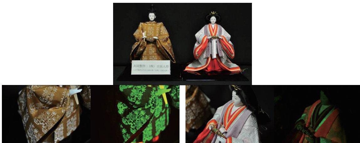
Fig. 3 Doll of the emperor and empress dressed in traditional costume with embroidery design using green fluorescent silk and red fluorescent silk (Upper, left & right: white light, Center two: blue LED)